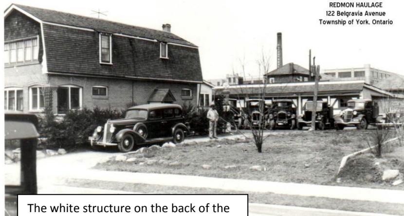
1937 REDMON HAULAGE 122 Belgravia Avenue Township of York, Ontario