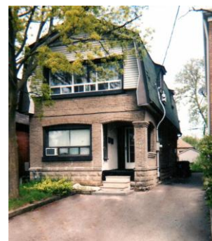
122 Belgravia Avenue taken in 2019